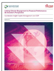
Linking Climate Engagement to Financial Performance: An Investor's Perspective September 2013