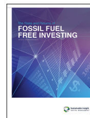
The Risks and Returns of Fossil Fuel Free Investing September 2014

To subscribe to SICM's research please sign up on our website: www.sicm.com