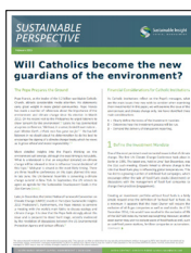
Will Catholics Become the New Guardians of the Environment? February 2015