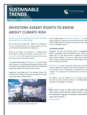
Sustainable Trends Quarterly Newsletter Q1 2016