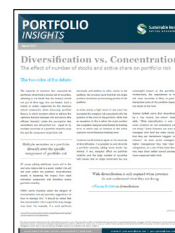
Diversification vs. Concentration: The Effect of Number of Stock and Active Share on Portfolio Risk March 2015