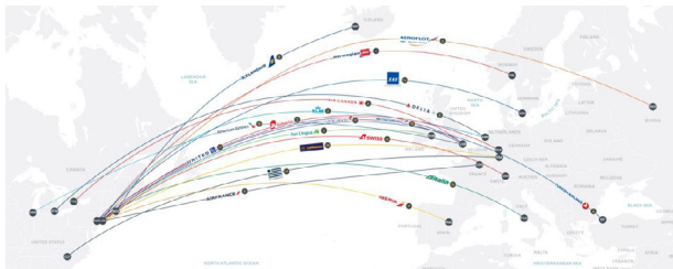
Transatlantic airline fuel efficiency ranking, 2014 (link)